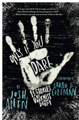
Only If You Dare: 13 Stories of Darkness and Doom